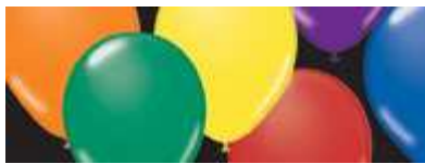
Solid Color Round Latex