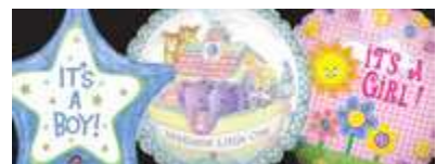
New Arrival & Baby Shower