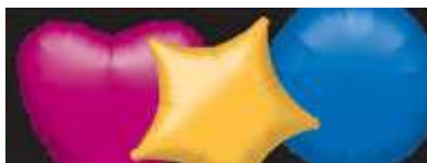
Solid Color & Shapes