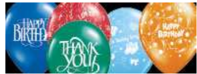
Message Latex Prints