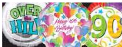
Over the Hill & Landmark Birthday