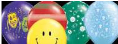
Decorator Latex Prints