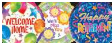
Welcome Home & Retirement