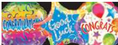
Congratulations & Good Luck