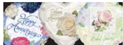
Anniversary, Wedding & Shower